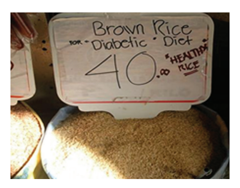
Figure 2. Packaging of brown rice as healthy rice in one rice retailing store in Cebu City

A total of 49 brown rice retailer-respondents were included in the study. The result of the survey revealed that the price of brown rice is highly dependent on the source and packaging of the product. For example, if brown rice has been packaged as healthy rice (Figure 2), there is a premium price of Php5/kg even of the same variety which passed the same processes (Figures 2 and 3 with markings 1 and 3). More so, 'Jasmin' brown rice is more expensive than the ordinary brown rice coming from ordinary rice variety (Figure 3 with markings 1 and 2). 'Jasmin' is a type of rice variety with good eating quality or palatability. Likewise, brown rice has been classified depending on the target buyer as shown in Figure 3.