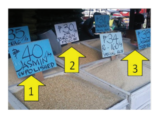
Figure 3. Different prices of brown rice in one retailing store in Nueva Vizcaya

Figure 2. Packaging of brown rice as healthy rice in one rice retailing store in Cebu City